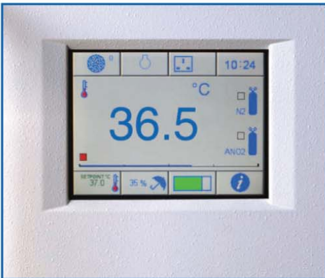
Intuitive operational software accessed via a full colour touch screen interface