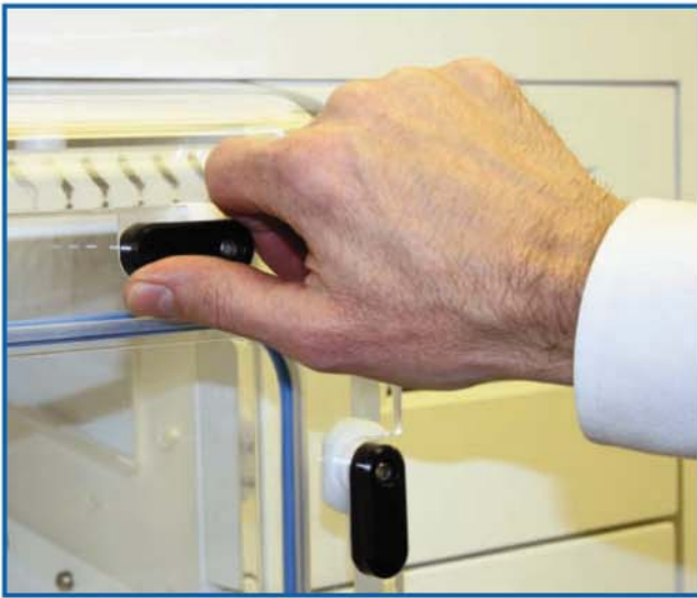
Optional easily removable front for equipment transfer, bulk sample transfer and thorough cleaning