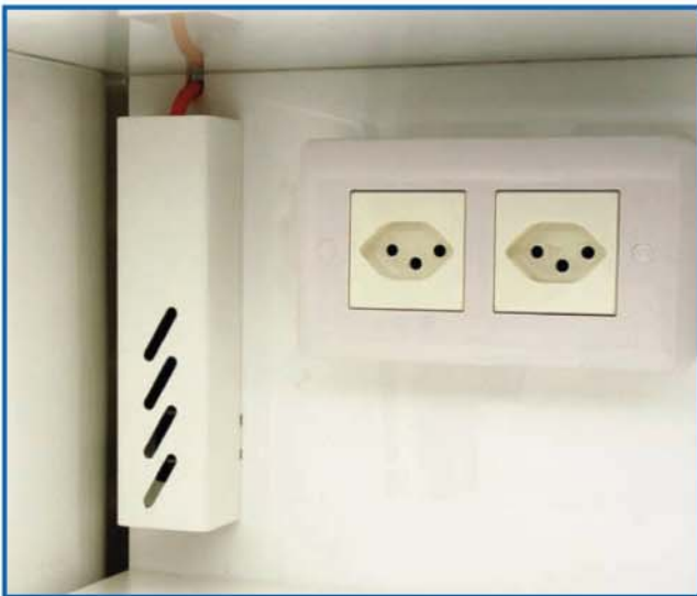
Optional internal country-specific mains power sockets.