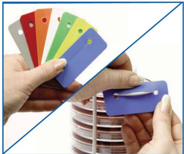
Basket Tag Set