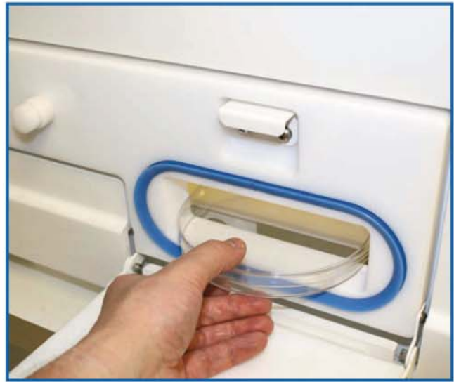
Optional 15cm Letterbox - Ideal for introducing individual samples quickly.